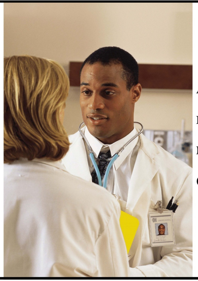
A Guide to Maryland Law on Health Care Decisions (Forms Included)

STATE OF MARYLAND OFFICE OF THE ATTORNEY GENERAL